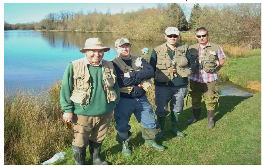
A Few of our Members at Bushyleaze

The lake was well stocked with trout (and pike as a few of us found out!) mainly around the 2.5 mark but a few 10 lb Brownies were spotted swimming by, but couldn't be coaxed to take the fly.